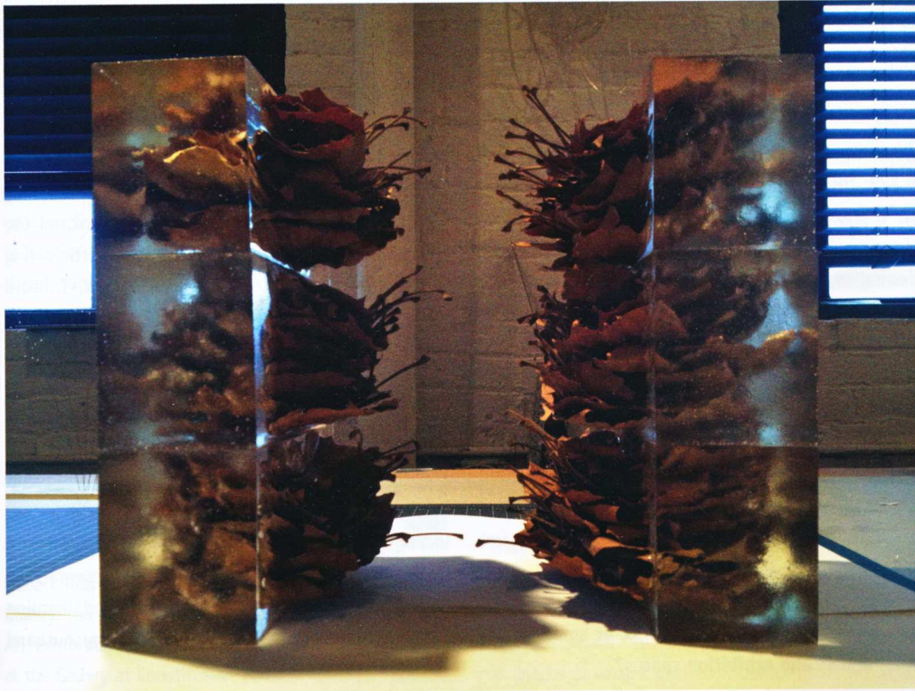
Beth Galston, Sycamore Wall , 2003, resin, sycamore leaves, 12" x 8" x 14".

Sculpture deals in time, the unfolding envelope of our human condition, from the gestation of the creative impulse to its compression and representation in the work itself. Boston Sculptors Gallery on Harrison Street inaugurates the New Year with its 20th anniversary celebration as a sculptors' cooperative and an exhibition of 57 extra-ordinary objects highlighting sculpture's less-celebrated fourth dimension. From the ridiculous to the sublime, each work opens a door to multiple worlds of time, metaphor and meaning.