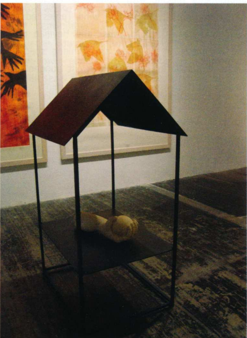
Nora Valdez, Holding , 2012, limestone, metal, 41" x 18" x 24".

One might wish here for a definitive statement to wrap up the dialogue about sculpture and time. However, the diversity of the works described, as well as the many that also deserved mention, suggests that the conversation on this subject has only begun.