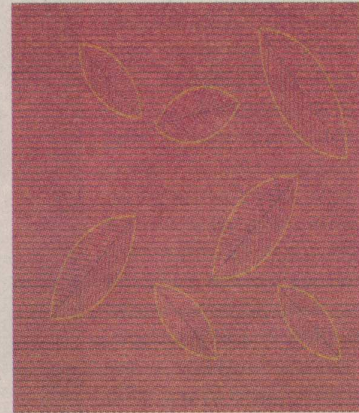
ILLUSTRATIVE LEAF PAVING

The need for fences between the park and courts was questioned, with some claiming the fences make access difficult. Murray added that law enforcement asked that any fences in the