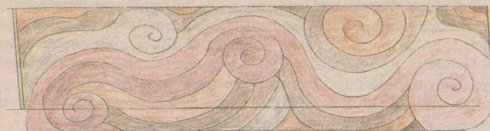
SWIRL PAVING OPTION 2