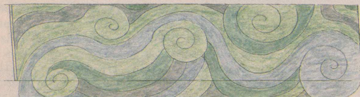
SWIRL PAVING OPTION 3

Graphics Courtesy Boston Parks and Recreation Department, Jamaica Plain Centre/South Main Streets, Ray Dunetz Landscape Architecture, Beth Galston, Artist