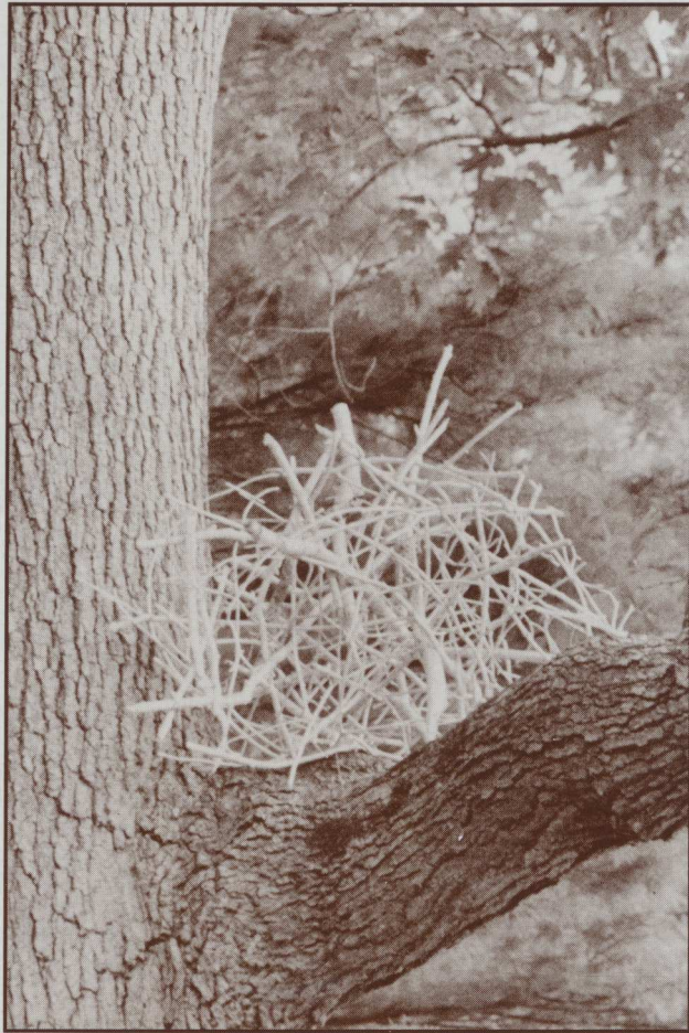
Pathways, painted tree branches, 24" to 36" high